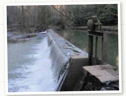
Weir on the River Frome near Oldbury Court

8 Having turned left opposite the steps, follow the path to a bridge where you cross a stream and continue up the slope to emerge into a large open grassy area. Turn right and continue until you reach a tarmac path. Turn left and follow this path down to the exit from the park just above Frenchay Bridge. Now retrace the route you walked earlier: either straight ahead through the woods back to Lincombe Barn; Or turn urn right up the hill and retrace the route you walked earlier, passing Oldbury Court School and turning left into Sidelands Road. At the end of the road follow the path between the wall and the hedge until you see the children's play area on your left. Turn left into Lincombe Barn open space and car park.