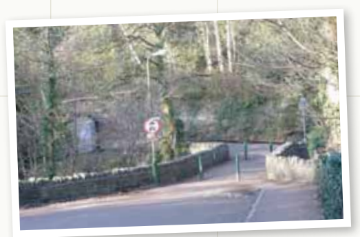
Bridge over the River Frome, junction of Frenchay Road and Pearces Hill